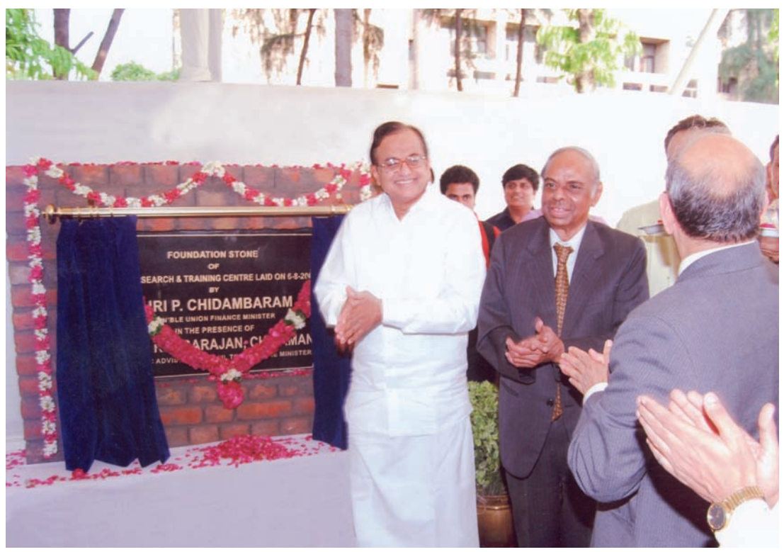
Hon'ble Minister for Finance P. Chidambaram at the foundation stone laying ceremony

Countries in over 16 training programmes spread over 9 months from April 2007 to December 2007. A training programme on Budget Management was conducted for senior officials from Government of Afghanistan. The Institute continued its efforts to contribute to the quality of teaching and research through a refresher training programme on Public Finance in Theory and Practice for College and University Teachers selected from all over the country, Other important training programmes included Fiscal Policy and Public Finance module training for probationers of Indian Economic Service, Indian Audit and Accounts Service, and Tax Policy and Administration for probationers of Indian Revenue Service and officers of the Commercial Tax Department, Government of Andhra Pradesh.